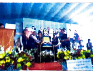
Deputy Chief Minister Snaibwalang Dhar along with other dignitaries cut the jubilee cake during the Golden Jubilee celebration of MBOSE in Tura on Wednesday.

HP NEWS SERVICE Shillong, Oct 18: The Meghalaya Board of School Education (MBOSE) began its golden jubilee celebrations in Tura today. Deputy Chief Minister Snaibwalang Dhar was the chief guest at the inaugural function, which was marked by colourful cultural performances and a nostalgic reflection of the board's five-decade journey. The theme for the golden jubilee is "Celebrate the past, embrace the present and rise to the future." Addressing a huge gathering of distinguished dignitaries and academics, Dhar extended his heartfelt gratitude for the achievements of MBOSE over the past 50 years. In 1973, the year MBOSE held its first High School Leaving Certificate (HSLC) examination, just 38.3 per cent of the 3,797 students passed. The pass percentage has now risen to 78 per cent 50 years later, MBOSE Controller of Examinations TR Lalao informed. Dhar acknowledged the significant progress and development in the education sector of the region in spite of various challenges. The Deputy CM also commended the