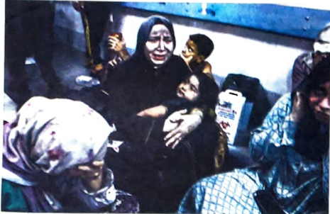
Wounded Palestinians sit in al-Shifa hospital in Gaza City, central Gaza Strip, after arriving from al-Ahli hospital following an explosion there. The Hamas-run Health Ministry says an Israeli airstrike caused the explosion that killed hundreds at al-Ahli, but the Israeli military says it was a misfired Palestinian rocket.