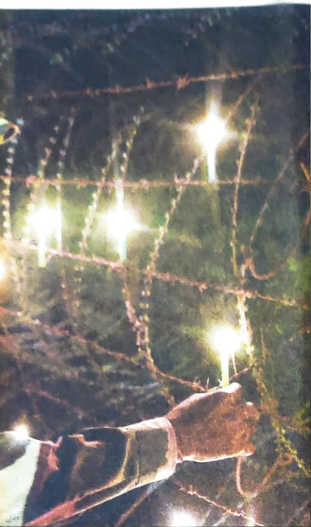
India-Bangladesh border fence to celebrate with Dimaier district on Sunday night

Scan and visit our website for news in real time