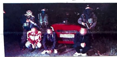
Ki lai ngut ki snar nonglute kiba la shah kem ha ki Pulit ka EKH.