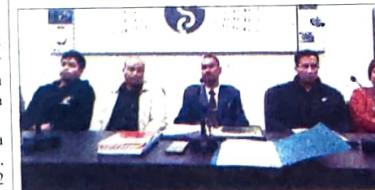
Ki nongialam ka JAC kiba dang kren sha ki lad pathai khutor ha ka sngi Balang.