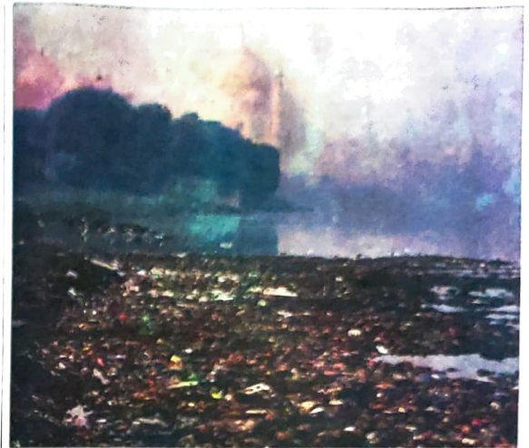
Garbage seen on a polluted bank of the Yamuna river near the historic Taj Mahal in Agra, Wednesday.

The State government said that beautification of the area will be done once the residents of the colony are shifted to a new site.