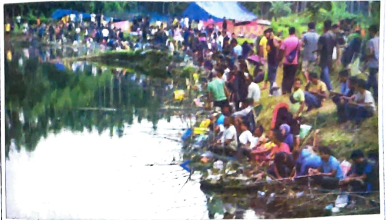
Border residents of Assam and Meghalaya take part in an angling competition along the Assam-Meghalaya border, at Hahim in Kamrup district, on Friday.