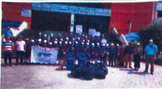
A Swachhata Drive was organised today at Nongpoh Town Shopping Complex organized by Central Bureau of Communication Shillong in association with the Bharat Scouts & Guides of Alpha English Hr. Sec. School, Nongpoh as part of the 3 Days Outreach Programme on Swachh Bharat Abhiyan, Nutrition & Meri Maati Mera Desh.