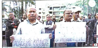
graduate, Mynta ka sngi ka NEHUTA, ka la [bteng sla 2]