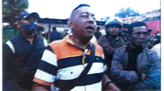
ka sorkar namar ka sorkar ka ju ong, na ka por sha ka por ba kam ju don ka kamai kajih kaba biang, Ha ka jingia kren bad bad ki lad [bteng sla 7]