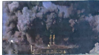
Ha kawei pat ka khubor, U Secretary General jong ka Nato, Jen Stoltenberg, u kren shai, ba ka Israel, kam long marwei, ha kane ka jingiakuh jongka bad ki ri ka NATO, ki

Tel Aviv, 12 Risaw: Ki khubor, kiba dang shu tob, ki iathuh ba ka Israel, ka la ther bom, ha Damascus bad kumjuh ha ka kad liengsuim jong ka Aleppo ha Syria bad la iathuh, ba ka Israel, ka byrthen, ba kan dang pynjur, ia ka jingleit ther bom jongka, ia ka Syria, ha ki sngi, ki ban sa wan.