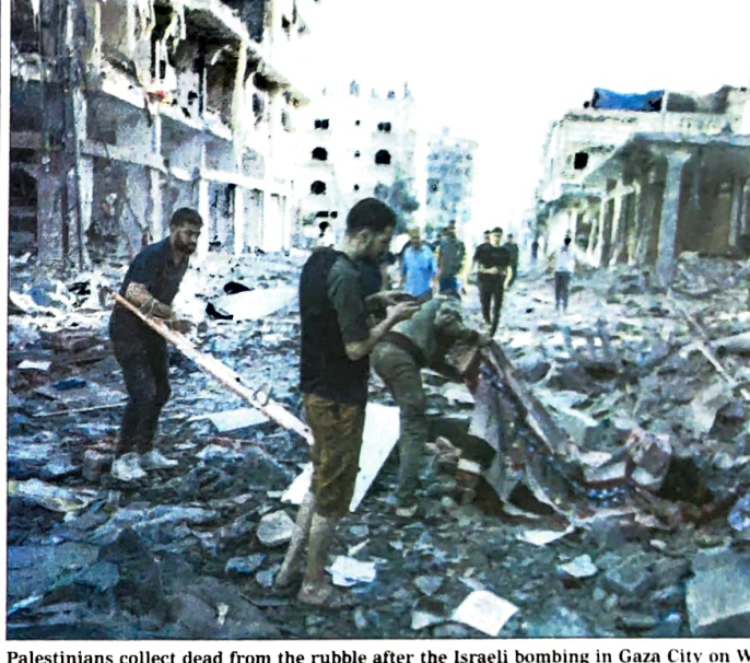
Palestinians collect dead from the rubble after the Israeli bombing in Gaza City on W

Jerusalem, Oct 11 (PTI): Palestinians in the sealed-off Gaza Strip struggled to find any safe area on Wednesday, as Israeli strikes demolished entire neighbourhoods, hospitals ran low on supplies and the territory's only power plant ran out of fuel, deepening the misery of a war sparked by a stunning and deadly assault by Hamas militants.