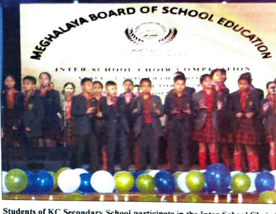
Students of KC Secondary School participate in the Inter-School Choir Competition organised by the Meghalaya Board of School Education as part of its jubilee celebrations, at U Soso Tham Auditorium, on Wednesday.

From Our Correspondent MAWKYRWAT, Oct 11: