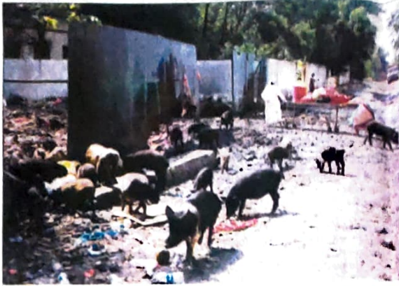
Pigs root for scraps as workers struggle to push a food waste trolley through a hospital rubbish tip in Nanded, Maharashtra

Earlier on September 11, the dorbar shnong of Thangskal and Jaintia Students' Union (JSU) had demanded the State government to disqualify Ayush Kumar from the list of selected candidates for the MBBS state quota because he is not a permanent resident of the village.